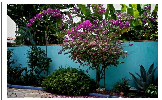
BEFORE EMF REMEDIATION