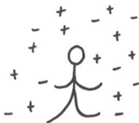
The Ideal Field